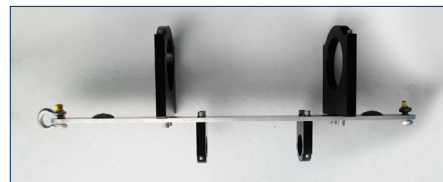
Instrument and Battery Mooring Bracket