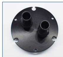
Water-Pumped Head Accessory