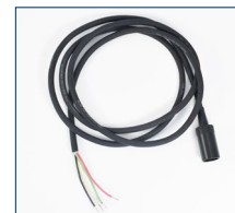
Pigtail Cable with Locking Sleeve