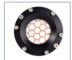
Copper Antifouling Shield