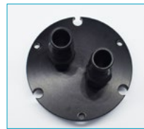
Water-Pumped Head Accessory