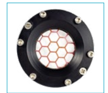
Copper Antifouling Shield