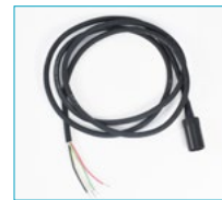
Pigtail Cable with Locking Sleeve