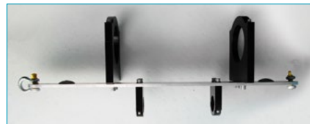
Instrument and Battery Mooring Bracket